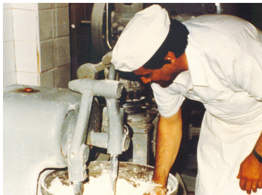
Figure 1. Baker's asthma is an important occupational disease, caused by inhalation of wheat and other cereals flours.

Common symptoms of food wheat allergy can begin within a few minutes after eating, or they can start a few hours after. Symptoms often involve the skin and include reactions such as rashes, swelling around the mouth, hives, and eczema. Also, symptoms can typically involve the intestines and might include diarrhea, vomiting, nausea, indigestion, and stomach and abdominal cramps.