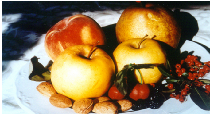
Figure 4. Cross-reactivity between grass-pollen, cereals flours and fruits belong to Rosaceae family are very common in patients allergic to pollen.

Peach non-specific lipid transfer protein (Pru p 3; nsLTP) has been characterized as the major food allergen in the adult Mediterranean population. Its wheat homologous protein, Tri a 14 has a relevant inhalant allergen in occupational baker's asthma. Different sensitization patterns to these allergens have been found in patients with this latter disorder 28 . Cross-reactivity between grass-pollen, cereals flours and fruits belong to Rosaceae family (Figure 4) are very common in patients allergic to pollen. Sensitization only to a LTP from peach can be associated with more severe symptoms like anaphylaxis.