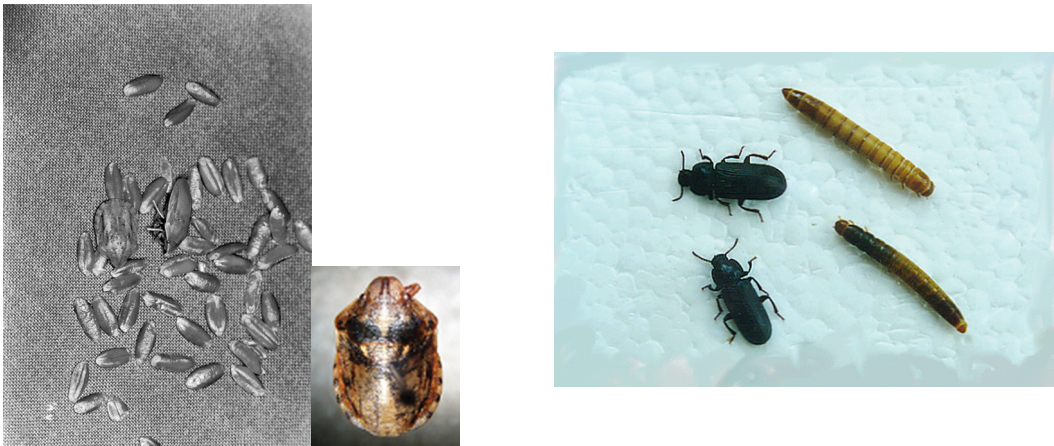
Figure 2. Members of the \alpha -inhibitor family of wheat are proteases with have a potential role as a biological defence against the insect infestation of the grain. In the figure Eurygaster austriaca (left) and Tenebrio molitor (right). The first is a frequent pest of wheat and the second parasite the barley.

In celiac disease, limited information is available regarding cereal allergens responsible for allergic reactions, although both diseases can affect at the same patient 14,15 . Celiac disease is a lifelong intolerance to the gluten found in wheat, barley and rye, genetically determined as in allergic diseases. Of the patients with celiac disease 95% are human leucocyte antigen (HLA-DQ2 or HLA-DQ8 positive). Characteristically, the jejunal mucosa becomes damaged by a T-cell-mediated autoimmune response that is thought to be initiated by a 33-mer peptide fragment in A2 gliadin, and patients with this disorder have raised levels of anti-endomysium (AEA) and tissue transglutaminase antibodies (tTG) in blood samples. This disease is the major diagnosable food intolerance and, with the event of a simple blood test for case finding, prevalence rates are thought to be approximately 1:100 15 .